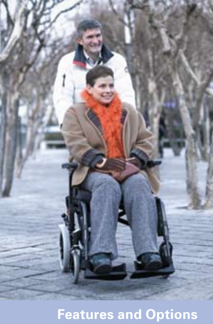
Features and Options